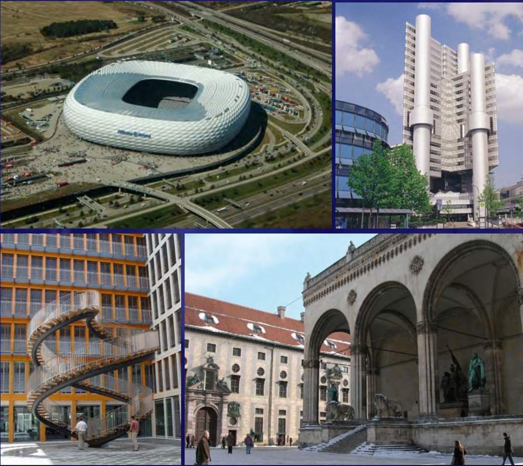
Top Left: Hubschrauber Rundflug Muenchen Helicopter Tour. Top Right: Skyscraper of HypoVereinsbank. Bottom Left: KPMG Munich. Bottom Right: Feldherrnhalle Odeonsplatz

Complete your tour with a visit to Munich's newest architectural wonder – the BMW Welt. With a futuristic façade and impressive mirrored double cone it is difficult to believe that the interior could match this, and yet it does. Car-lovers and non-car lovers alike will come here to see the latest BMW cars and motorcycles, and learn about the incredible technology and design elements that power one of the most famous products literally on the road.