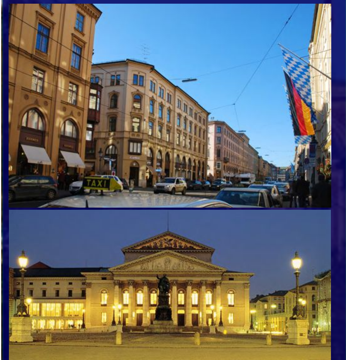
Top: Maximilianstrasse, Bottom: Nationaltheater Bavarian State Opera

This tradition was continued by King Maximilian II with the creation of Maximilianstrasse. Not content with just a royal avenue, he also commissioned the National Theatre Munich with its Corinthian columns and scintillating palace of marble, gold and crystal as well as building the palatial Maximilianeum which is framed by neo-Gothic palaces showcasing Munich's grandeur. Nowadays, this famous boulevard is known for its collection of exclusive boutique and upmarket designer stores.