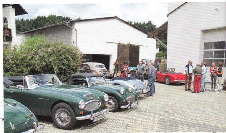
Lots of Healey waiting for Brewery tour after lunch.