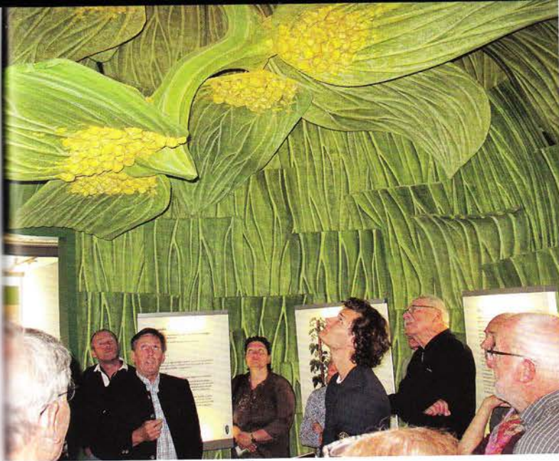
Herr Reich explains to a very interested public.

height on both sides of the road, the young hops growing skyward inching their way up the wires like coiled snakes unleashing their energy seeking the sun. We also „snaked“ our way through the area on those narrow, tiny curving roads. Everything around us was emerald green, looking totally different since I and Edi last drove through the area to write the road book in spring when everything was still wintery brown and bare.