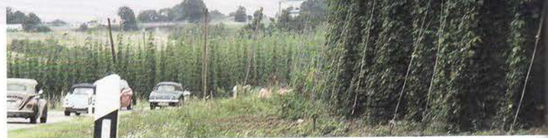
On tour in Hopfen fields.