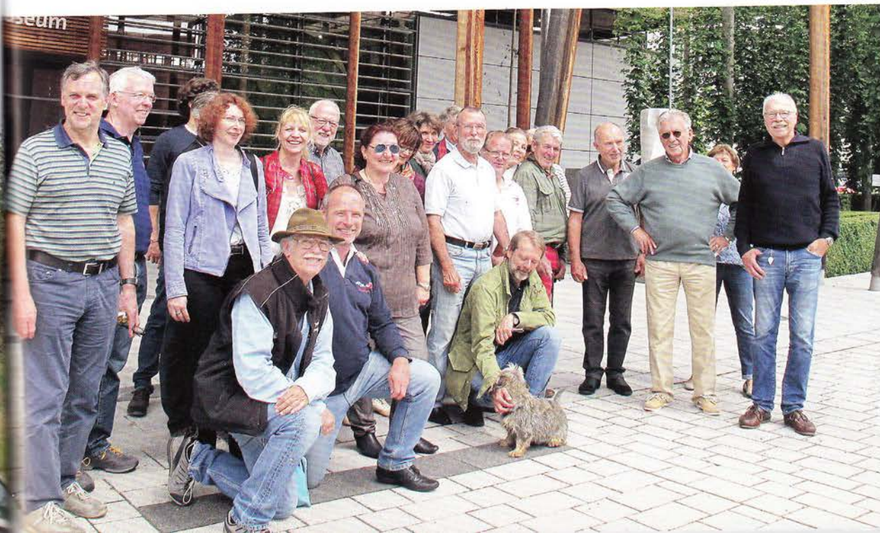
Members of Munich Austin Healey Stammtisch visit Deutsches Hopfenmuseum July 17, 2016.

Niederlauterbach Axelbachstraße 10 D-85283 Wolnzach Tel. 08442/964650